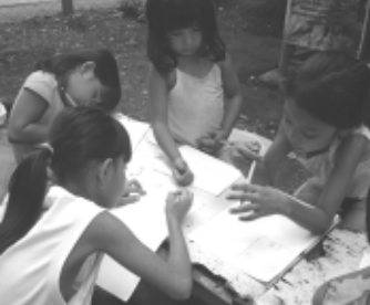
community children involved in participatory risk assessment