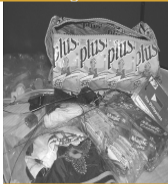
making of Go Bags (evacuation bags) as livelihood option for mothers in Buklod Tao