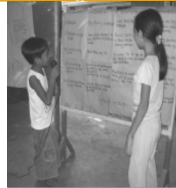
participatory risk assessment in Dagupan City (PROMISE project)