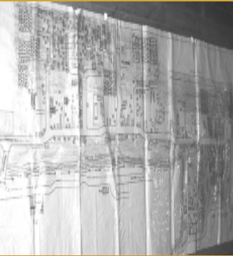
hazard and resource mapping in Bocayao Norte, Dagupan City (PROMISE project)