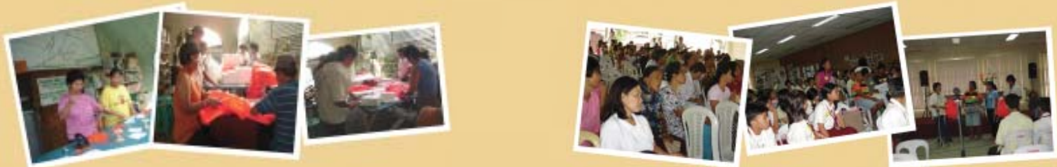
Community youth and students of Center for Positive Future sharing on their involvement in COPRAP. (left, center) Mothers sharing about the life vest and Go bag they produced. (right)