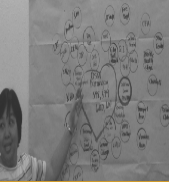
CBDRM training with Child Fund Japan - Philippines