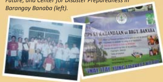
Tarpaulins with disaster preparedness messages for the community (right).